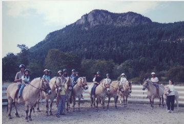
Fjords of Narnia