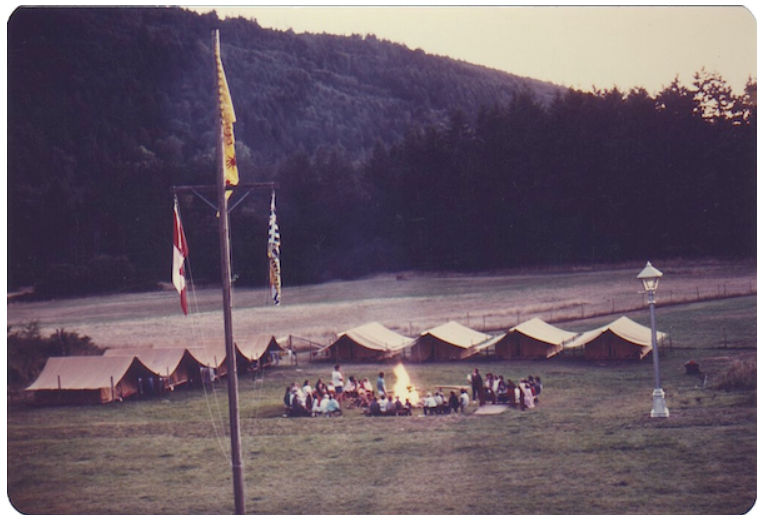
Camp Narnia on Salt Spring Island in 1986.

It's been thirty years since Camp Narnia welcomed its very first campers, back on our original property on Salt Spring Island. Three decades of programs filled with imagination and adventure and joy and wonder and magic... Here's to many more yet to come!